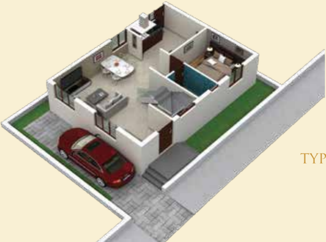
TYPE-D GROUND FLOOR