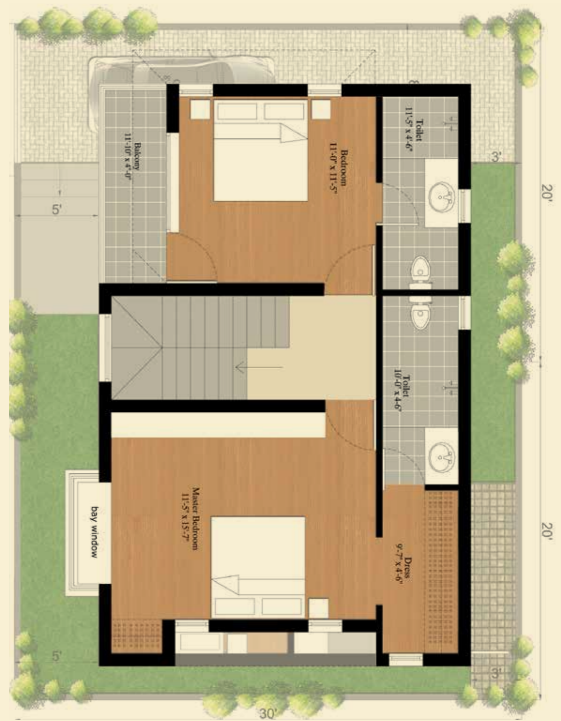
TYPE-D FIRST FLOOR