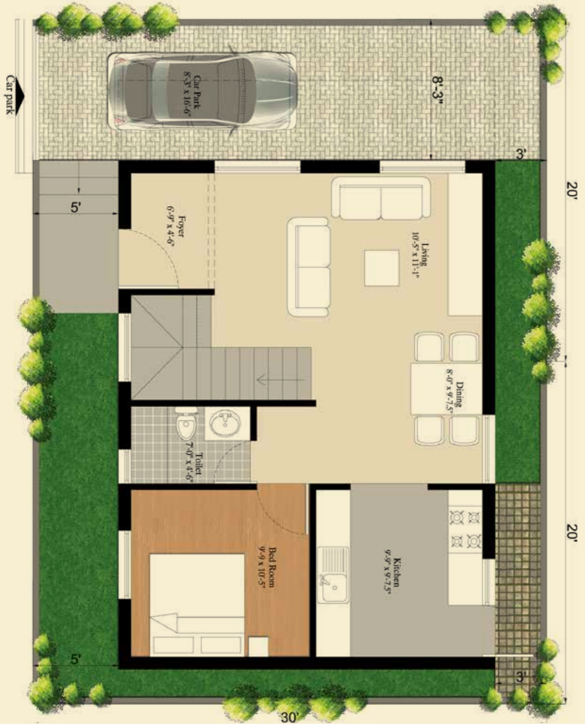
TYPE-D GROUND FLOOR