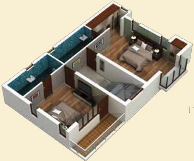
TYPE-D FIRST FLOOR